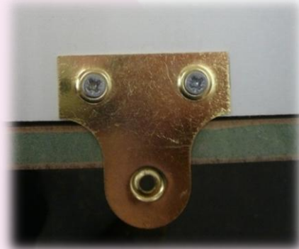
Fig.2 – Mirror plate ready for wall fixing.

Please ensure you select the appropriate fixing for the wall where the product is to be situated.